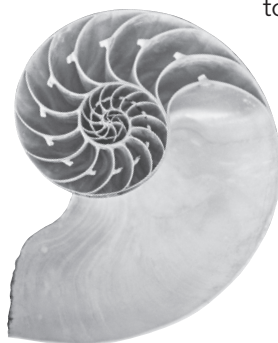
A nautilus shell showing the chambers

Bible believers know that humans and dinosaurs lived at the same time, not because footprints prove it but because the animals were created with man on day six of creation week (Genesis 1:24-31). In the book of Job, God speaks of two large aquatic creatures " chief of the ways of God " named Behemoth and Leviathan. He says,